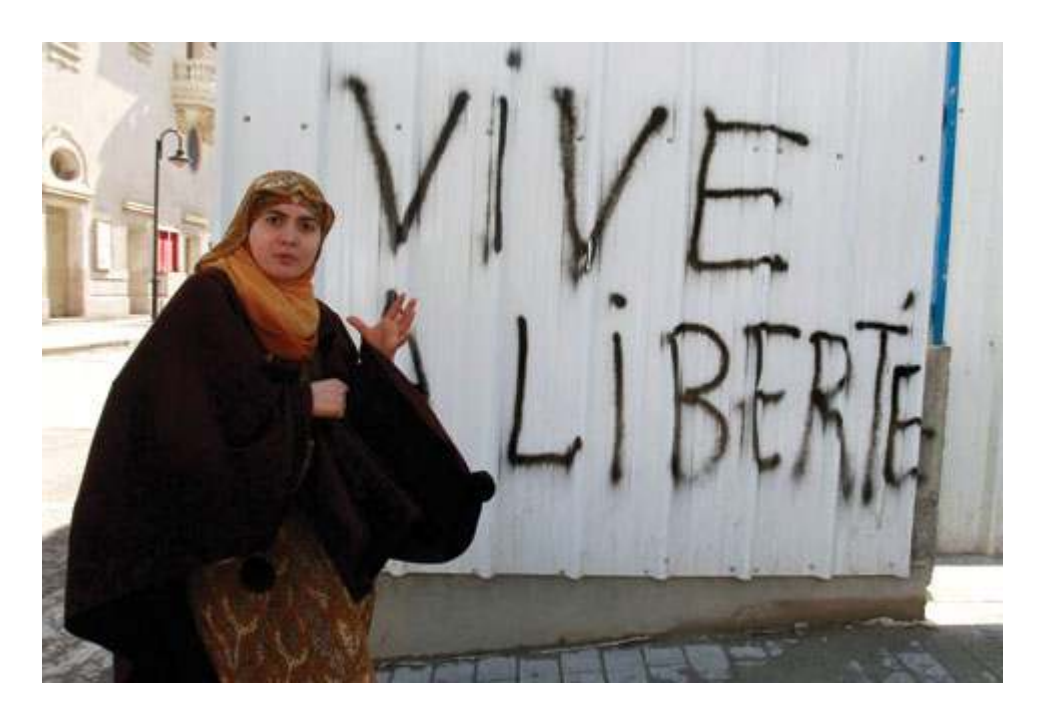
Long live freedom!" declares graffiti in Tunis: Tunisian men and women mobilized side-by-side against the authoritarian regime.

Women have to be part of the future. And it's imperative that as constitutions are created, as political parties are organized, as elections are waged and won, nobody can claim a democratic future if half the population is marginalized or even prevented from participating.<sup>223</sup>- Hilary Clinton, 20117