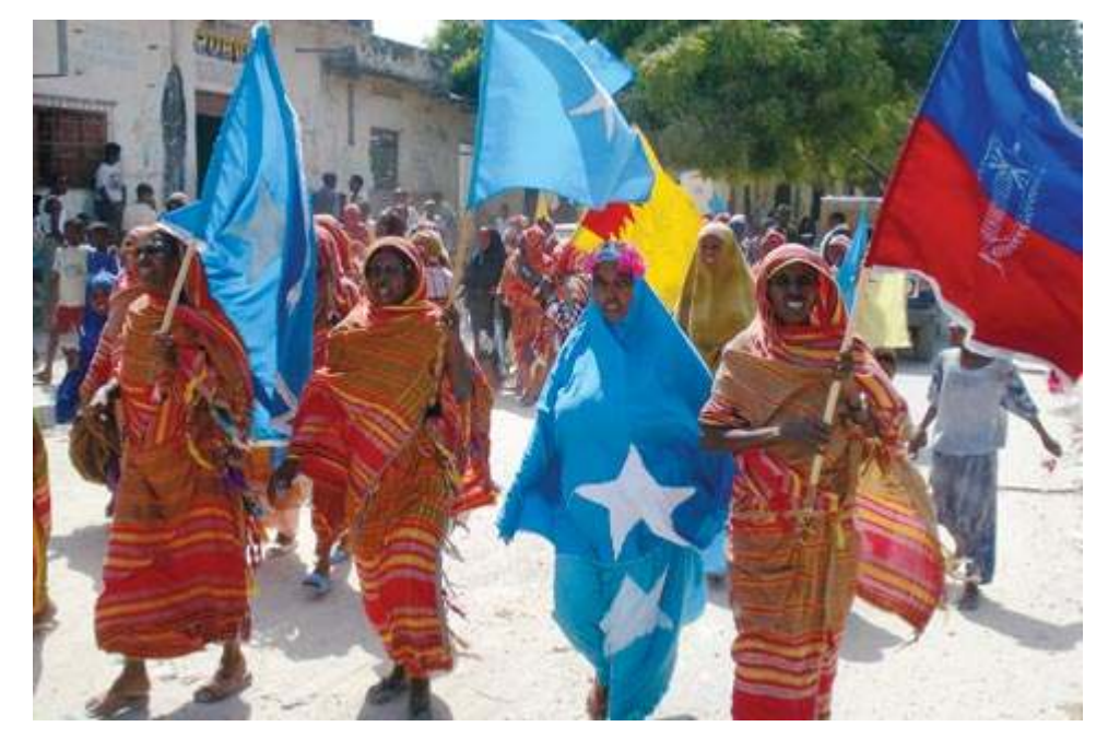
Across Africa, women's movements are now putting more emphasis on decision-making power.

Sub-Saharan Africa has also seen recent progress, with Ethiopia, Madagascar and the United Republic of Tanzania recording improvements in 2010. Women now have better access to a level of decision making that directly impacts their lives and the issues they care about. According to the Africa Progress Report for 2011, "Women's representation in parliaments in Sub-Saharan Africa is now higher than in South Asia, the Arab states or Eastern Europe." Rwanda is by far the most female-friendly legislature in the world, with women holding over 50% of the parliamentary seats. "From its inception, The African Union adopted a 50 per cent quota for women's representation, which is reflected in the composition of the AU Commission. Again, this standard reflects and reinforces efforts to enhance women's representation at the national level. Angola, Mozambique and South Africa have exceeded the 30 per cent benchmark for their legislatures. Rwanda made history in 2008 when 56 per cent of legislators elected to parliament were women, the highest in the world".