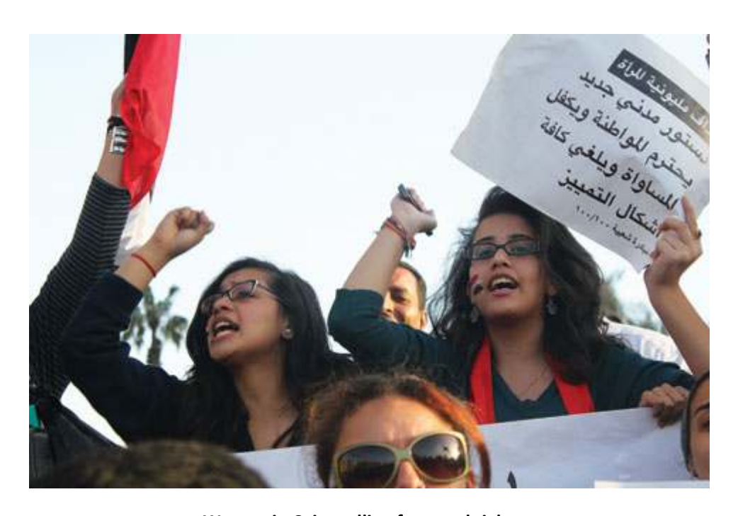
Women in Cairo calling for equal rights.

2010 and 2011 were very important years for women's political participation. In 2010, gains for women were registered in just half of all parliamentary elections or renewals. The most notable progress was seen in Northern Africa in post-revolutionary Egypt, Tunisia and Libya. North Africa saw women's representation in single or lower houses increased from 9.0 per cent to 11.7 per cent between 2010 and 2011. In Tunisia, the gender equality law was enacted by the recently elected Tunisian Islamist Party as a basic law that can only be repealed by two-thirds majority, (as opposed to a law that can simply be repealed by a soft majority). While the gender equality law is not perfect, it is a great first step.