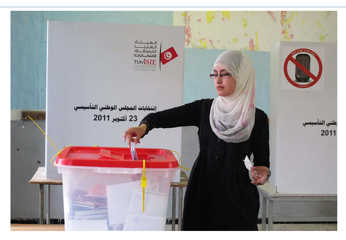
WOMAN VOTING IN TUNISIA CONSTITUENT ASSEMBLY