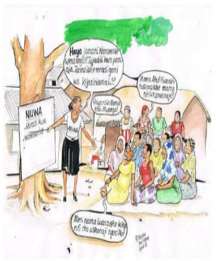
Fig 2: NUWA uses IEC materials such as fliers, brochures, cartoons & story books